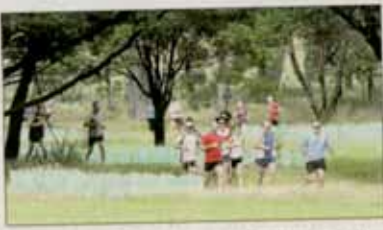
Right on track: Kembla Joggers use the upgraded circuit.

"This will make the site a spectacular venue in the